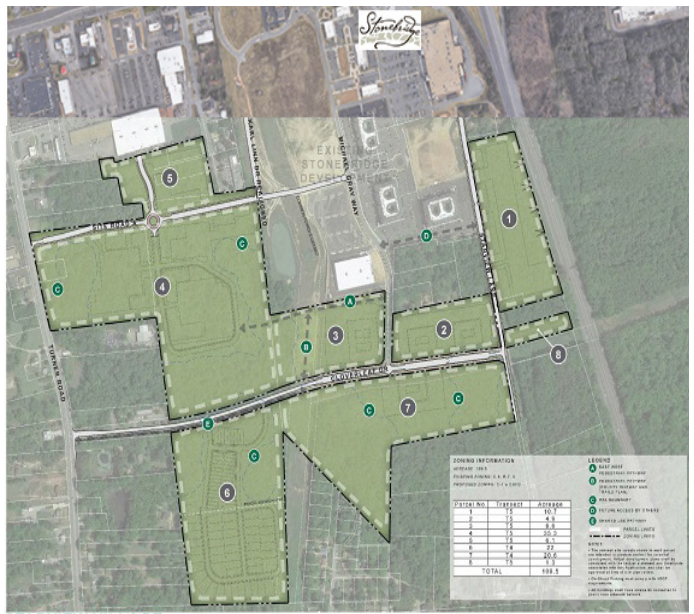
STARVIEW VILLAGE EXHIBIT A - STARVIEW VILLAGE CONCEPT PLAN 01/27/2020 01:14:58

https://richmondbizsense.com/2020/01/27/county-oks-starview-village-set-to-add-1000-plus-homes-near-stonebridge/