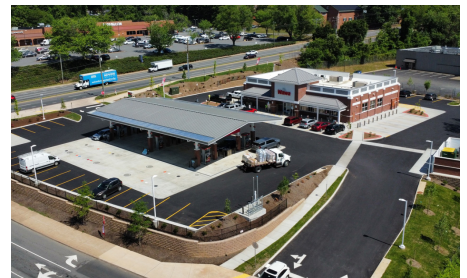
5th Street Wawa

Market: Richmond, VA Opportunity: Brand new, 20-year Wawa ground lease Status: Under Contract Contact: Catharine Spangler