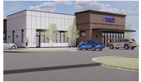
CenterWell Senior Primary Care