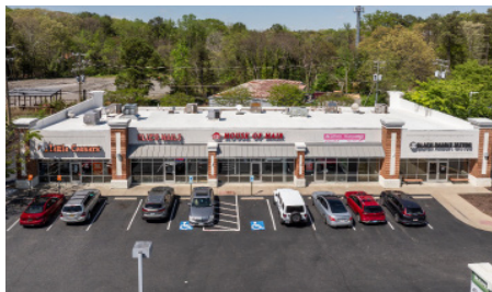
Shoppes at Forest Hill

Market: Front Royal, VA Opportunity: 232,447 SF grocery anchored opportunity with significant upside Status: Sold for $22,500,000 Date | Contact: Mar-26 | C.Spangler