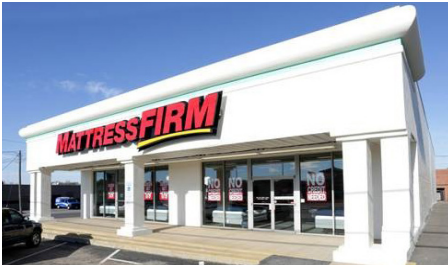
4914 W. Broad Street

Market: Richmond, VA Opportunity: Near term, below market rents, directly across from Willow Lawn Status: Marketing Contact: Catharine Spangler