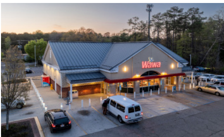
Forest Hill Wawa