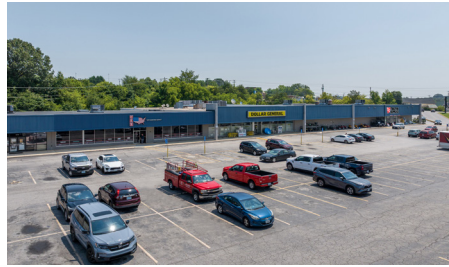
Kings Fairground Plaza

Market: Richmond, VA Opportunity: Near term, below market rents, directly across from Willow Lawn Status: Marketing Contact: Catharine Spangler