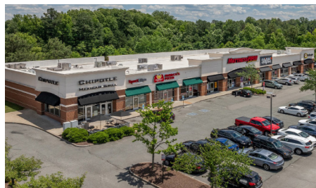
Virginia Center Station

Market: Emporia, VA Opportunity: High performing Food Lion anchored center with subdivided outparcel opportunity Status: Sold for $7,600,000 Date | Contact: Oct-25 | C.Spangler