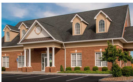
Wytheville First Bank and Trust

Market: Richmond, VA Opportunity: Proven ground leased Wawa with 16.5 years of term remaining. 7% escalation in 2027 Status: Sold for $5,000,000 Date | Contact: Apr-26 | C.Spangler