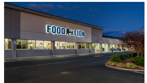
Staples Mill Plaza

Market: Richmond, VA Opportunity: 100% leased, Chipotle anchored strip center Status: Sold for $6,400,000 Date | Contact: Jun-25 | C. Spangler