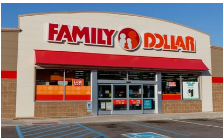
Family Dollar Portfolio