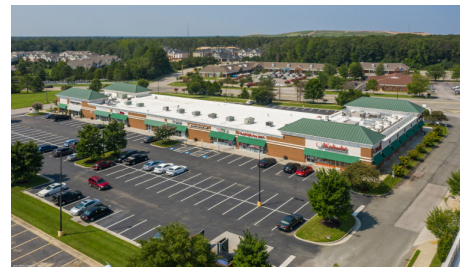
Shoppes at River Forest

Market: Richmond, VA Opportunity: 100% leased unanchored strip center with staggered lease expirations Status: Sold for $2,650,000 Date | Contact: Jan-26 | C.Spangler