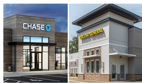
Dollar General & Chase Bank