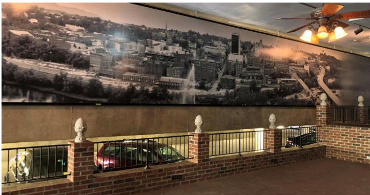
OUTSIDE TERRACE WITH PANORAMIC CITYSCAPE SCENE