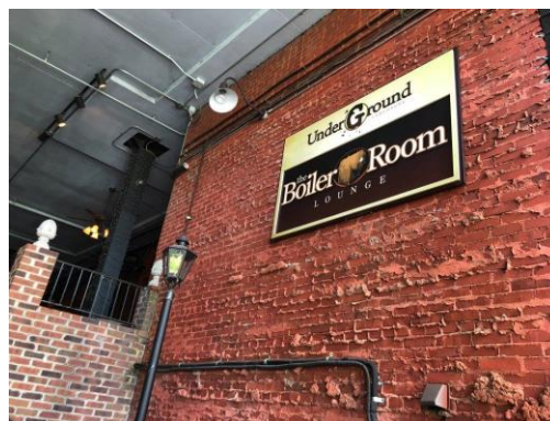
BOILER ROOM EXTERIOR SIGN