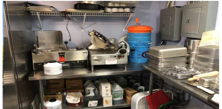
MAIN KITCHEN EQUIPMENT