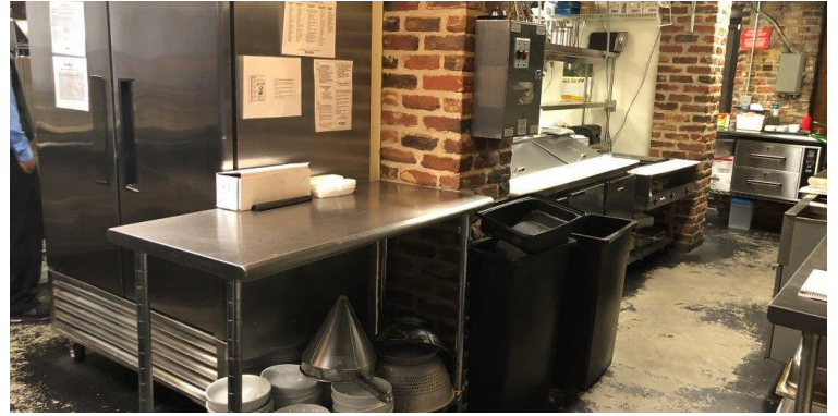
MAIN KITCHEN PREP AREA