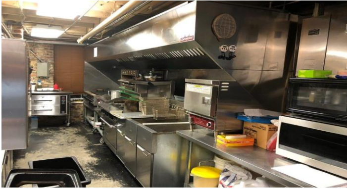
MAIN KITCHEN HOOD SYSTEM