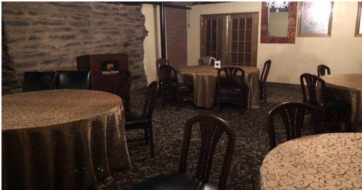
CONFERENCE | PRIVATE DINING ROOM