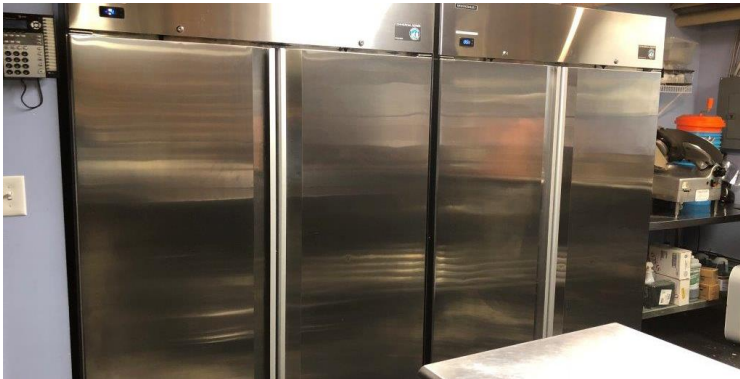
MAIN KITCHEN REFRIGERATION